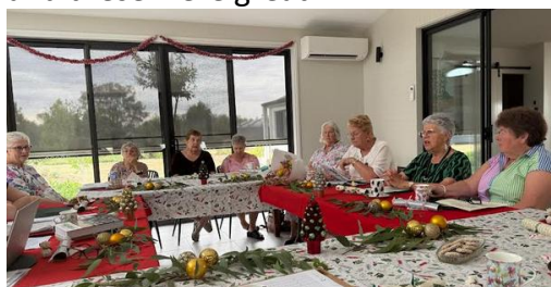
2025 Christmas Party

Our Kyris Kringle was something you'd made, and these were great.